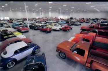
Largest Classic Car Dealer In Charlotte Over 1,000 Cars For Sale Nationwide!