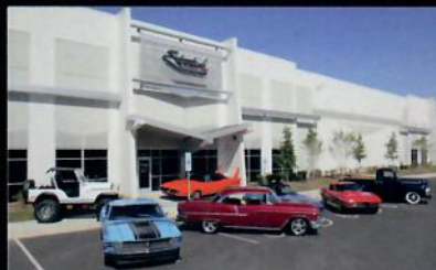
Exceptional Facility In Premier Location Secure & Climate Controlled