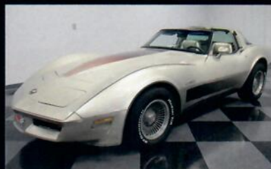
Global Customer Base & Worldwide Shipping, We Will Get You Top $$$