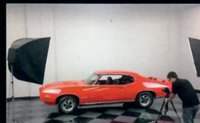
Professional Photo & Video Presentation, Top-Ranked Web Advertising, Hassle-Free Sales