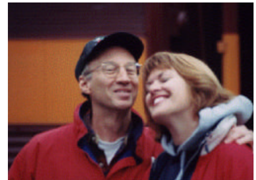
It's Miller Time!