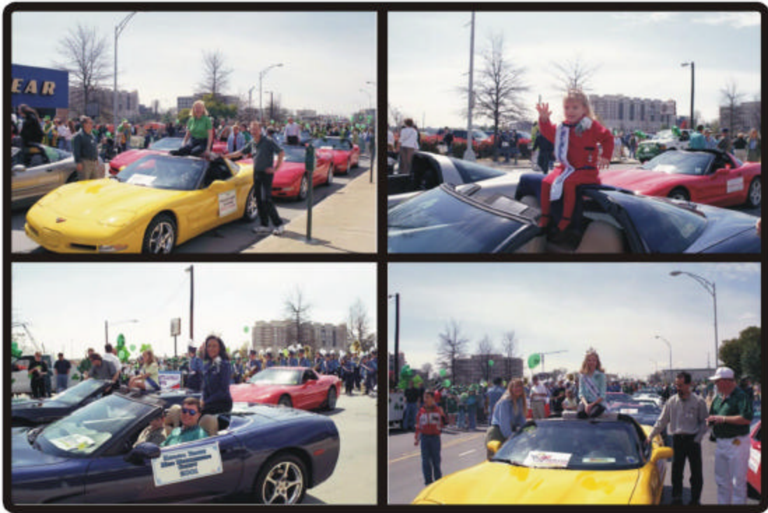
St. Patrick's Day Parade 2001