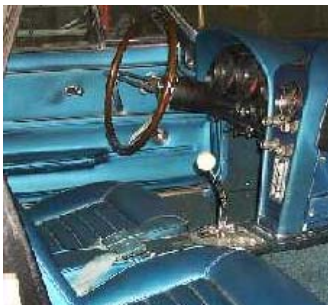
Interior looks brand new

A final note, on the top 50-fastest car's list, this car, the 1966 / 427 Corvette, is #4 with 9 Corvettes making the list. Thanks, Eddie for sharing with us.