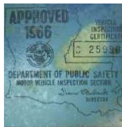
Original Louisiana Inspection Sticker