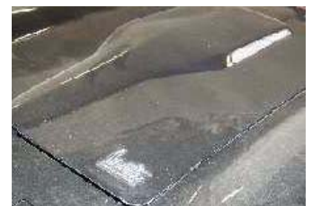
Famous 427 with Hood Emblem