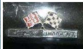
427 Fender Badge