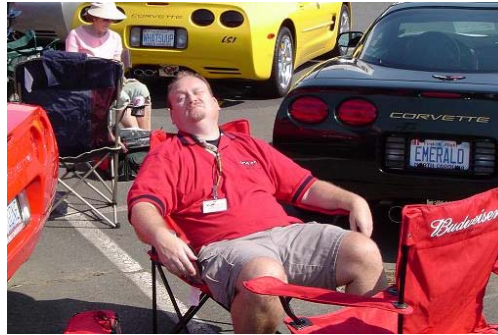
Sleeping or Catching some Rays, or both?