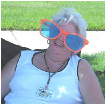
It was sunny and bright out!