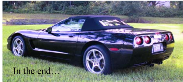
In the end...