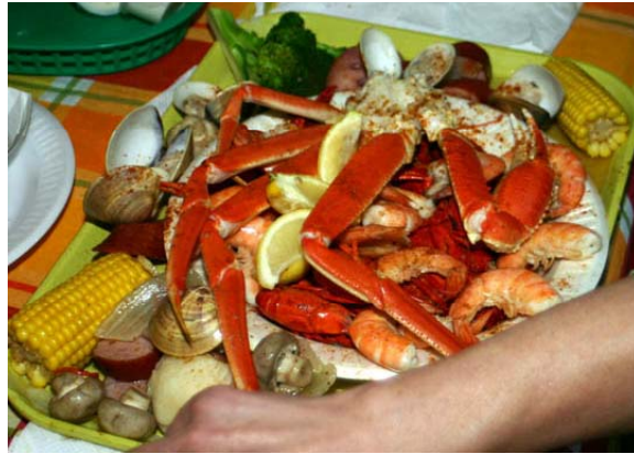
Servings At The Outback Crab Shack!