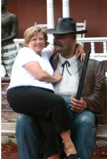
A handsome pair!