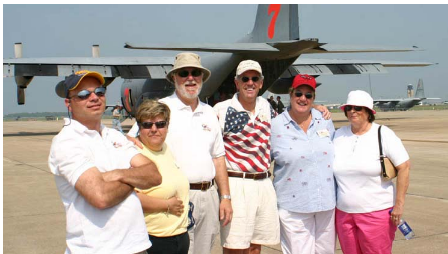
Enjoying the NC Air National Guard Family Day