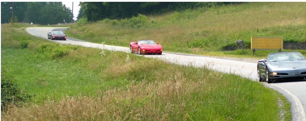
View From The Poker Run

USUALLY A SOCIAL GATHERING AT 6:00 PM WITH A BUSINESS MEETING AT 6:30 PM.