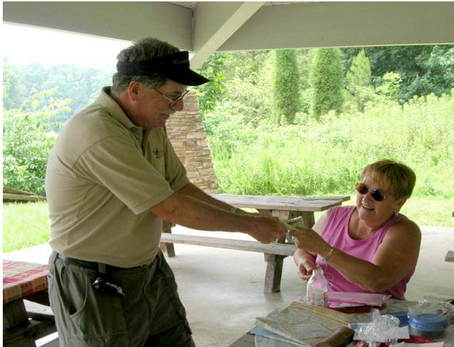
Friendly Dispute Over The Money Won