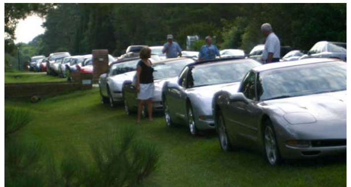
Amanda Drive Has Vettes Lined Up On Both Sides