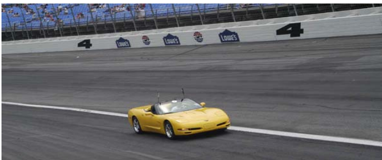
Wade – Look Out – You Are Going In The Wrong Direction!!