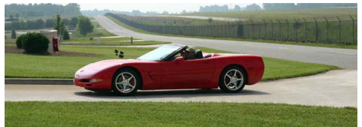
Pulling Into A Check Point