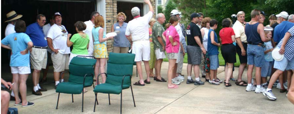
People Lining Up For that Great Burt BBQ