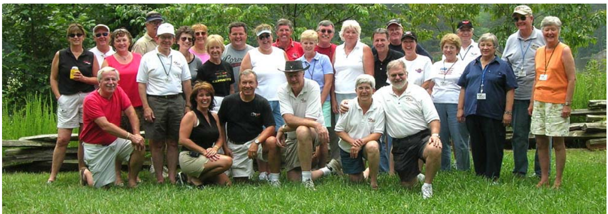
The Well Fed Survivors!