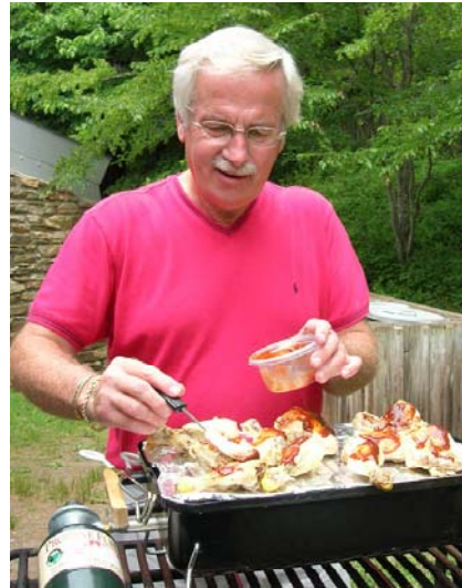
Ralph's Cookin Chicken!