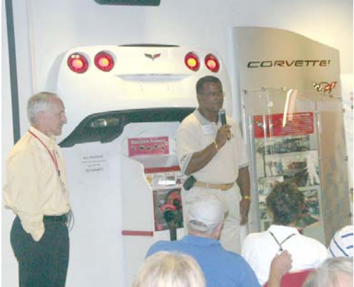
These babies are awaiting Museum Delivery!