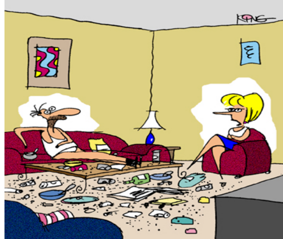
"I know I wanted you to stop going to those summer classic car shows so you could spend more time at home, well, I changed my mind."