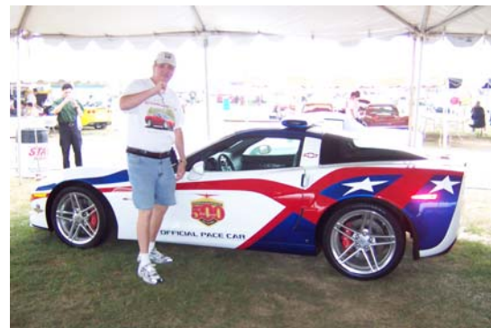
Wish I had. www.carsatcarlisle.com