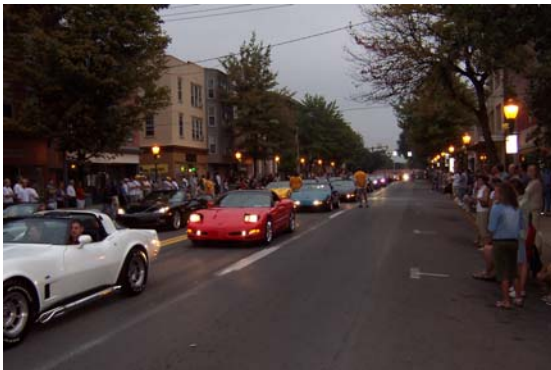
Corvette's of Carlisle Parade

Now for an update on the Le Mans Series: The Petit LeMans at Atlanta October 4 th should be a fun race. The Knight will be at turn 5-6 for a cool place to sit and have a cool drink. Yes, Corvette is still in first and second place. If you think they are just running around the track, you are wrong. Both the 3 and 4 car want to win and will do what they can to beat their other team members. Corvettes are running in both the GT1 and GT2 classes this year. Go to www.corvetteracing.com to watch a hot lap by the new ZR1.