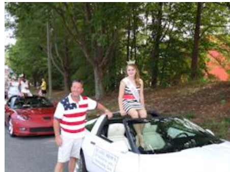
Matthews Alive Parade