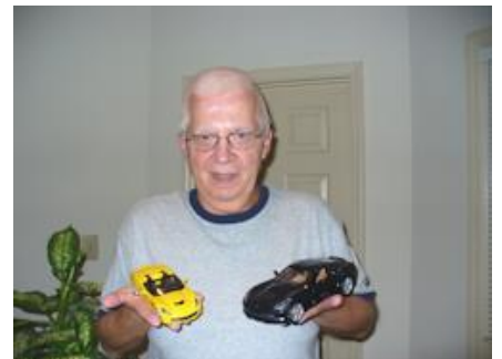
1 st C7 Owner in QCCC