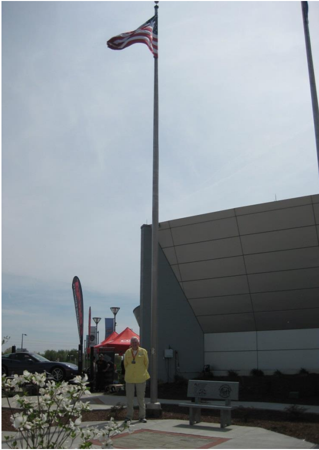
Don marking our bench spot.