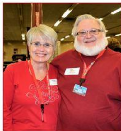
Ralph & Betty Snow 2014 Arctic White Coupe