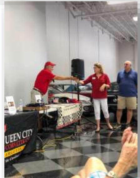
NCM 3rd Place Award for Newsletters