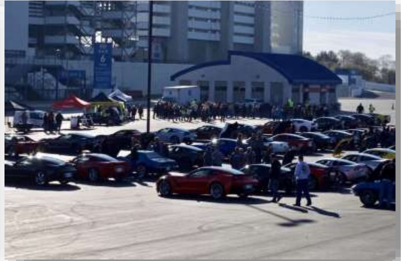
November 2, 2019 - Queen City Corvette Club supporting Carolina Charities! The Salvation Army through Corvette Angels at The Charlotte Motor Speedway and The Shriners at the Fun in the Sun Classic Car Show in North Myrtle Beach!