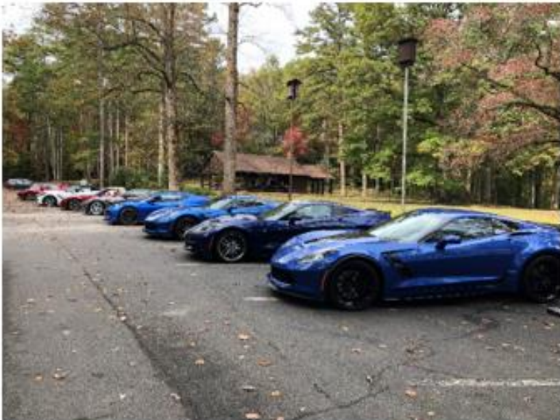
Table Rock 2021