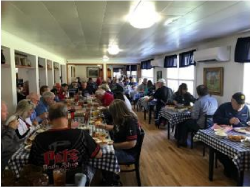
Lunch at Shatley Springs