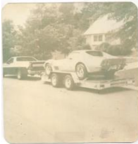
Original faded photo