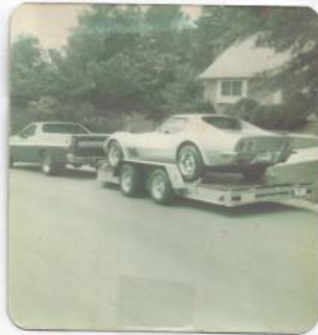
after colorized by Charlie Binder