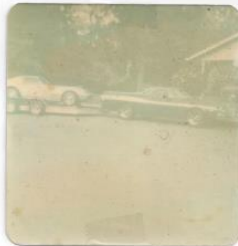
Original photo. Notice the fulcrum of the truck, trailer hitch at the tongue. How did this not crash in 1500 miles??